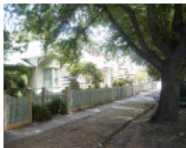
Pasco Street Heritage Precinct WILLIAMSTOWN, Hobsons Bay Heritage Study 2006