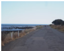
Point Gellibrand Heritage Precinct WILLIAMSTOWN, Hobsons Bay Heritage Study 2006