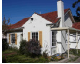
Solomit or Straw House Heritage Precinct ALTONA, Hobsons Bay Heritage Study 2006 - 171 Maidstone Street