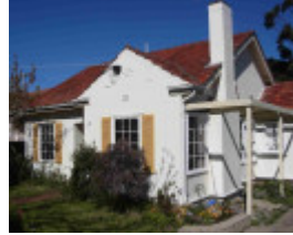
Solomit or Straw House Heritage Precinct ALTONA, Hobsons Bay Heritage Study 2006 - 171 Maidstone Street