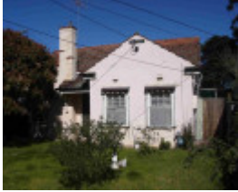
Solomit or Straw House Heritage Precinct ALTONA, Hobsons Bay Heritage Study 2006 - 169 Maidstone Street