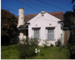
Solomit or Straw House Heritage Precinct ALTONA, Hobsons Bay Heritage Study 2006 - 169 Maidstone Street