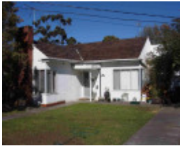
Solomit or Straw House Heritage Precinct ALTONA, Hobsons Bay Heritage Study 2006 - 175 Maidstone Street