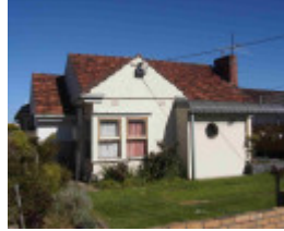
Solomit or Straw House Heritage Precinct ALTONA, Hobsons Bay Heritage Study 2006 - 173 Maidstone Street