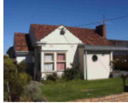
Solomit or Straw House Heritage Precinct ALTONA, Hobsons Bay Heritage Study 2006 - 173 Maidstone Street