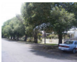
Verdon Street Heritage Precinct WILLIAMSTOWN, Hobsons Bay Heritage Study 2006