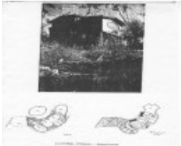
22494 Ross and Monica Larmer House - 42 Berrima Road, Donvale