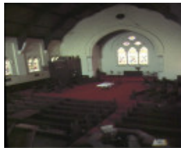
st judes church of england lygon street carlton interior