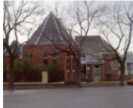
st judes church of england lygon street carlton halls sw jul99