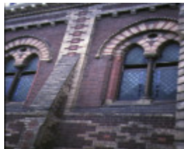
st judes church of england lygon street carlton window detail