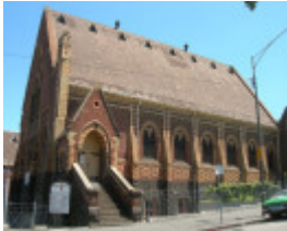
ST JUDES ANGLICAN CHURCH SOHE 2008