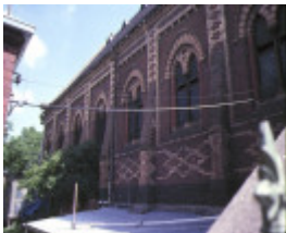
st judes church of england lygon street carlton side elevation dec1978