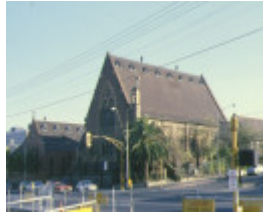
st judes church of england lygon street carlton front view