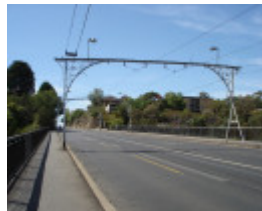
22610 Victoria street bridge richmond march07 ac gantries