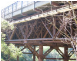
VICTORIA BRIDGE SOHE 2008