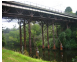
22610 Victoria street bridge richmond feb07 renee 2