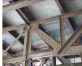
VICTORIA BRIDGE SOHE 2008