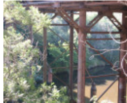
VICTORIA BRIDGE SOHE 2008