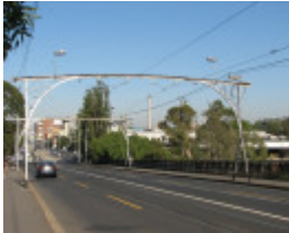
VICTORIA BRIDGE SOHE 2008