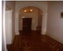
h01831 terrace kerferd rd albert park no31 ac2 june1999