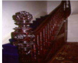
h01831 terrace kerferd rd albert park 31 ac2 june1999