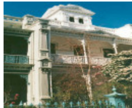
31 Kerferd Road