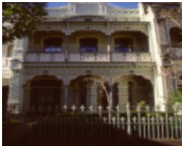
h01831 terrace kerferd rd albert park no33 ac2 june1999