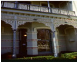
h01831 terrace kerferd rd albert park 33 ac2 june1999