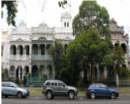
TERRACE SOHE 2008