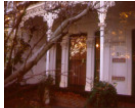
h01831 terrace kerferd rd albert park ac2 june1999