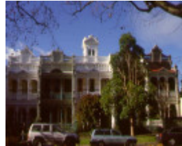
h01831 1 terrace kerferd rd albert park ac2 june1999