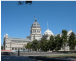
ROYAL EXHIBITION BUILDING AND CARLTON GARDENS (WORLD HERITAGE PLACE) SOHE 2008