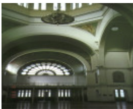
royal exhibition buildings nicholson street carlton dome interior