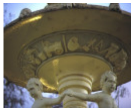
royal exhibition buildings nicholson street carlton fountain detail