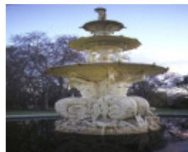
royal exhibition buildings nicholson street carlton fountain front view