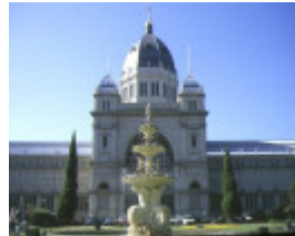
royal exhibition buildings nicholson street carlton front view aug1985