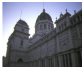
royal exhibition buildings nicholson street carlton side elevation