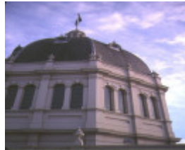
royal exhibition buildings nicholson street carlton dome detail