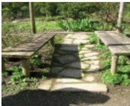
Manningham Heritage Garden & Significant Tree Study 2006