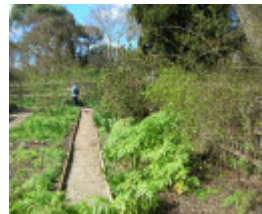
Manningham Heritage Garden & Significant Tree Study 2006