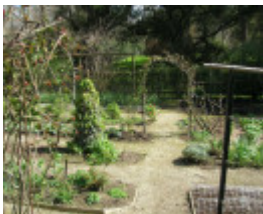
Manningham Heritage Garden & Significant Tree Study 2006