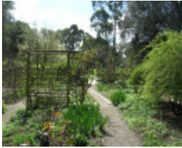
Manningham Heritage Garden & Significant Tree Study 2006