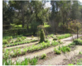
Manningham Heritage Garden & Significant Tree Study 2006