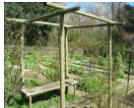
Manningham Heritage Garden & Significant Tree Study 2006