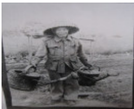
Georgie's Hut and Object Collection_Donald_photo2