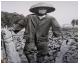
Georgie's Hut and Object Collection_Donald_photo