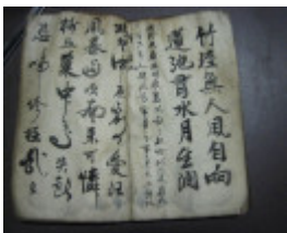
Georgie's Hut and Object Collection_Donald_13objects5