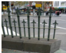
H2108 Underground Toilets Melbourne 08 06 06 mz 048