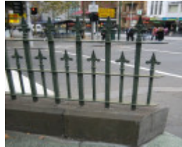
H2108 Underground Toilets Melbourne 08 06 06 mz 048