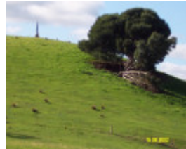
23073 Mount Koroite Cemetery Coleraine 1278