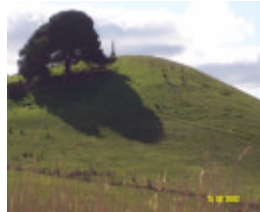
23073 Mount Koroite Cemetery Coleraine 1279