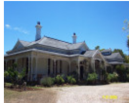
H0361 Kongbool Balmoral facade 2338