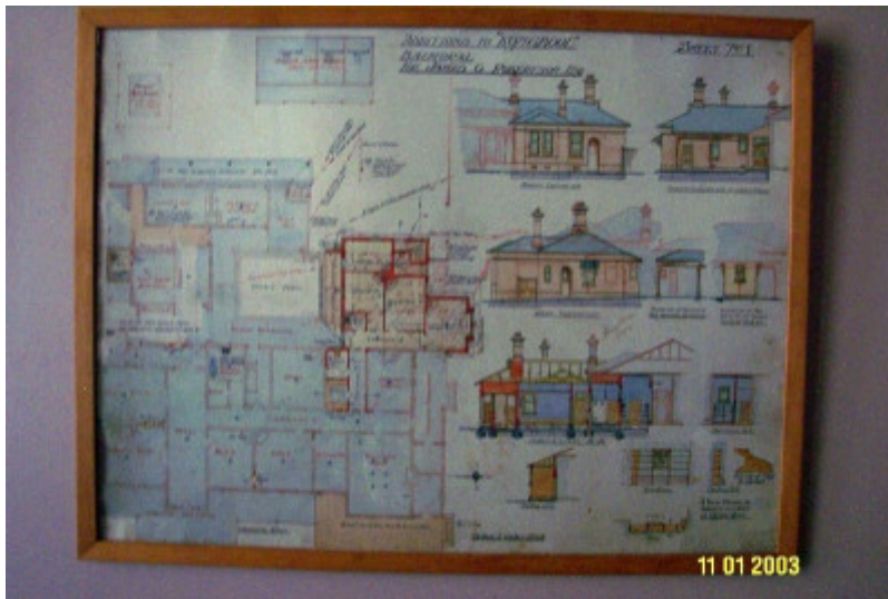
H0361 Kongbool Balmoral architect s dwgs 2372