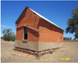
H0361 Kongbool Balmoral brick store 2371