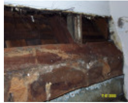
H0361 Kongbool Balmoral 1st valley gutter 2357