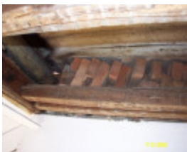
H0361 Kongbool Balmoral 1st former chimney 2363