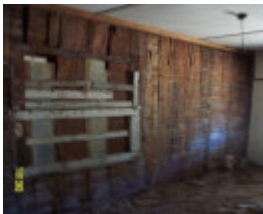
H0361 Kongbool Balmoral 1st blind window 2354