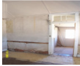
H0361 Kongbool Balmoral 1st rear room 2358