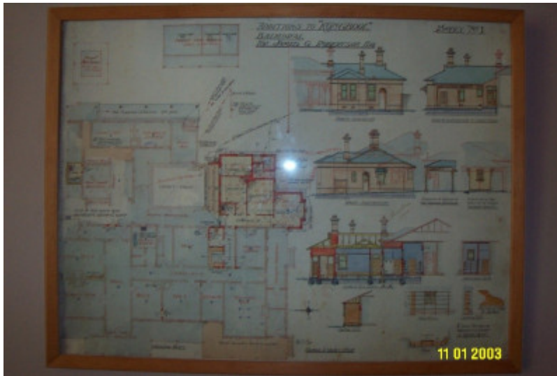
H0361 Kongbool Balmoral architect s dwgs 2373