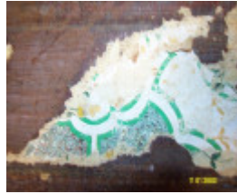
H0361 Kongbool Balmoral 1st wallpaper 2351