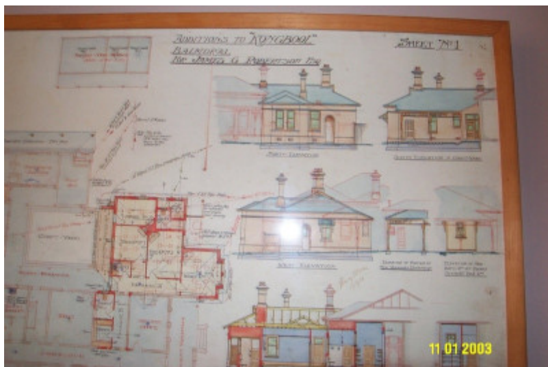
H0361 Kongbool Balmoral architect s dwgs 2377