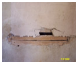
H0361 Kongbool Balmoral 1st hand split lathes 2360