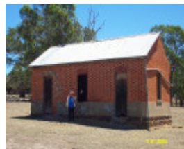
H0361 Kongbool Balmoral brick store 2367