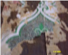
H0361 Kongbool Balmoral 1st wallpaper 2352