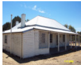
H0361 Kongbool Balmoral 1st facade 2346