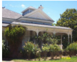
H0361 Kongbool Balmoral billiard room 2342