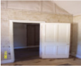
H0361 Kongbool Balmoral 1st imported door 2361