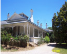
H0361 Kongbool Balmoral side elevation 2343