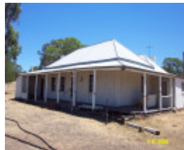
H0361 Kongbool Balmoral 1st facade 2347