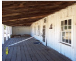
H0361 Kongbool Balmoral 1st verandah 2349