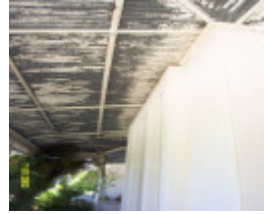
H0361 Kongbool verandah roof 2379