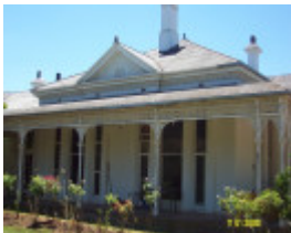
H0361 Kongbool Balmoral side elevation 2339