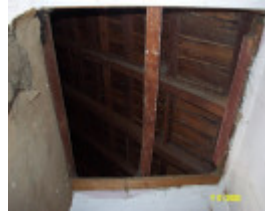
H0361 Kongbool Balmoral 1st shingles 2362