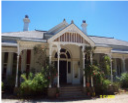
H0361 Kongbool Balmoral entrance 2341