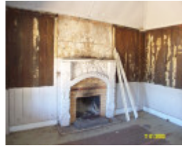
H0361 Kongbool Balmoral 1st main room 2350