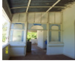
H0361 Kongbool conservatory 2378