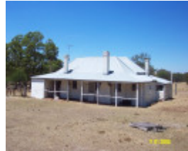
H0361 Kongbool Balmoral 1st facade 2345