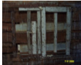
H0361 Kongbool Balmoral 1st blind window 2353