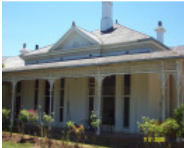
H0361 Kongbool Balmoral side elevation 2339