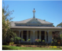
H0361 Kongbool Balmoral side elevation 2340