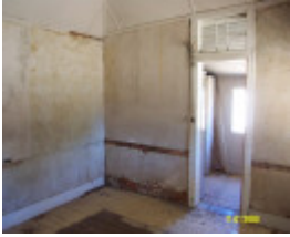
H0361 Kongbool Balmoral 1st rear room 2359