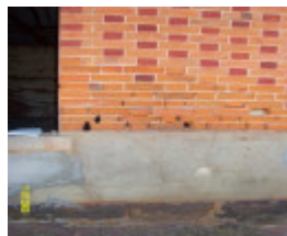
H0361 Kongbool Balmoral brick store 2370