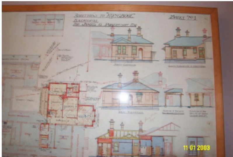
H0361 Kongbool Balmoral architect s dwgs 2377