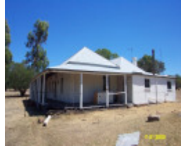
H0361 Kongbool Balmoral 1st side 2366