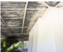
H0361 Kongbool verandah roof 2379