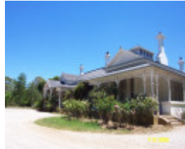
H0361 Kongbool Balmoral facade 2344