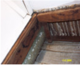
H0361 Kongbool Balmoral 1st valley gutter 2356