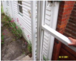
23173 Belle Vue second wing 0255