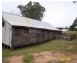
23173 Belle Vue woolshed 0251