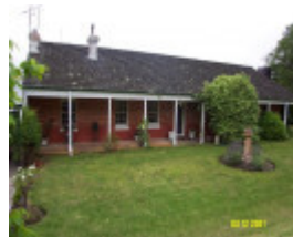
23173 Belle Vue third wing 0259