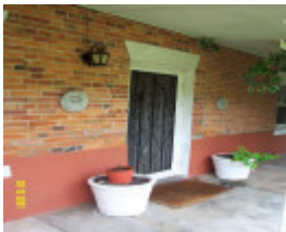
23173 Belle Vue third wing 0258