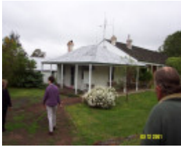
23173 Belle Vue second wing 0252