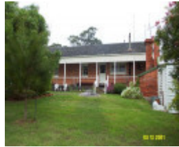
23173 Belle Vue third wing 0256