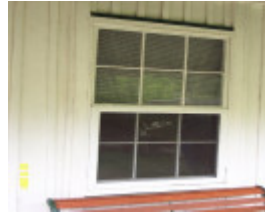
23173 Belle Vue second wing 0253