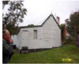
23173 Belle Vue second wing 0257