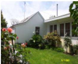
23188 Brung Brungle rear of outbuildings 0196