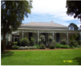
23188 Brung Brungle garden elevation 0194