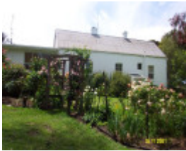
23188 Brung Brungle kitchen garden 0198