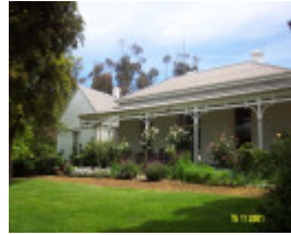
23188 Brung Brungle garden elevation 0195