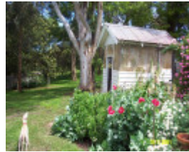
23188 Brung Brungle meat house 0197