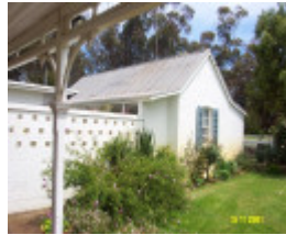
23188 Brung Brungle office 0192