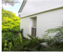
23188 Brung Brungle kitchen elevation 0199