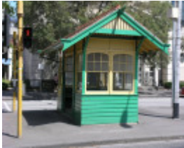
TRAM SHELTER SOHE 2008