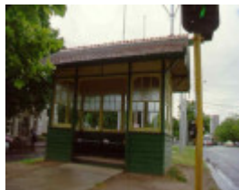
1 tram shelter cnr st kilda rd & dorcas st south melbourne