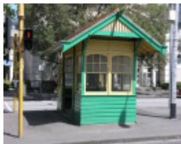
TRAM SHELTER SOHE 2008