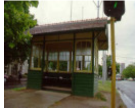
1 tram shelter cnr st kilda rd & dorcas st south melbourne