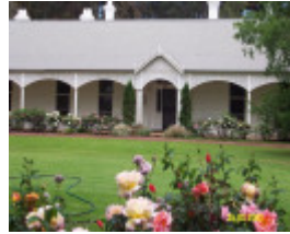
23195 Nareen Homestead Complex facade 1926