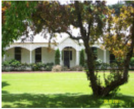
23195 Nareen garden facade 0285