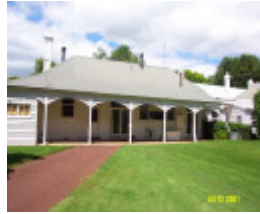
23195 Nareen homestead rear garden 0283