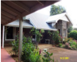
23196 Clifton Homestead 0314