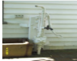
23196 Clifton Homestead old pump 0323