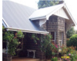
23196 Clifton Homestead 0315