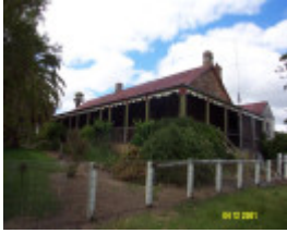
23196 Clunie Homestead front verandah 0271