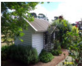
23196 Clifton Homestead outbuilding 0320