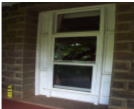
23196 Clifton Homestead original house 0312