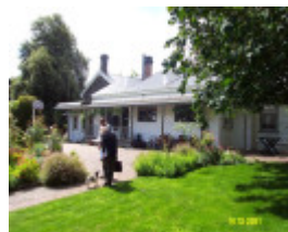
23196 Clifton Homestead rear elevation 0321