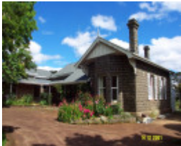
23196 Clifton Homestead 0317