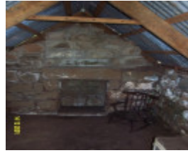
23196 Clifton Homestead smoke house 0318