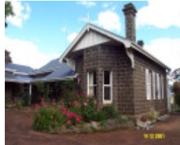
23196 Clifton Homestead 0316