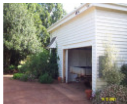
23196 Clifton Homestead rooms converted to garage 0324