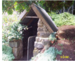
23196 Clifton Homestead smoke house 0319