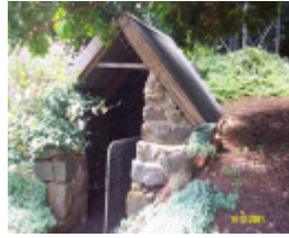
23196 Clifton Homestead smoke house 0319