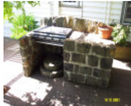
23196 Clifton Homestead old well 0322