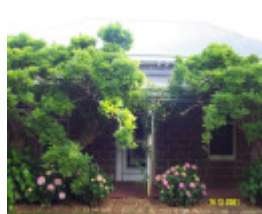
23196 Clifton Homestead original house 0326