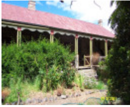
23196 Clunie Homestead front verandah 0270