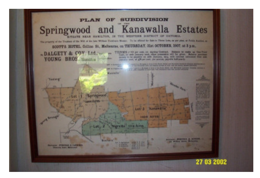
23205 Springwood Homestead Wannon subdivision map 2059