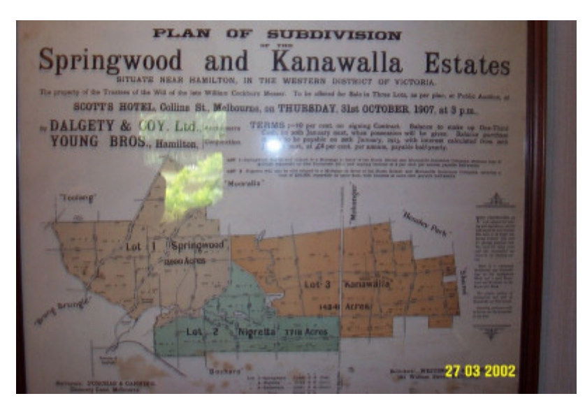
23205 Springwood Homestead Wannon subdivision map 2060