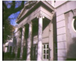
1 first church of christ scientist melbourne front elevation may1998