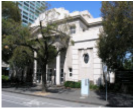
FIRST CHURCH OF CHRIST, SCIENTIST, MELBOURNE SOHE 2008