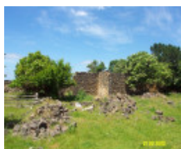
23288 Albert Homestead complex woolshed 1869