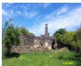
23288 Albert Homestead complex house 1863