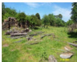
23288 Albert Homestead complex first house 1867