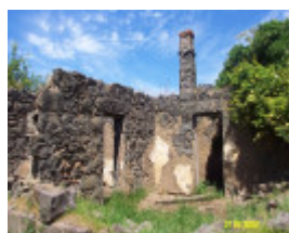
23288 Albert Homestead complex house 1865