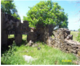
23288 Albert Homestead complex woolshed 1870