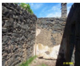
23288 Albert Homestead complex house 1864