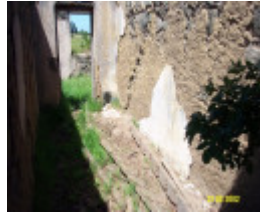
23288 Albert Homestead complex woolshed 1872