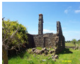
23288 Albert Homestead complex house 1859