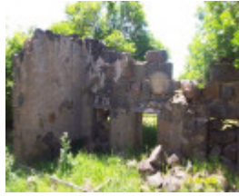
23288 Albert Homestead complex woolshed 1871