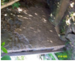
23288 Albert Homestead complex woolshed 1873