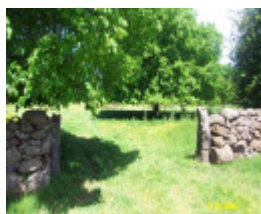
23288 Albert Homestead complex gateway 1874