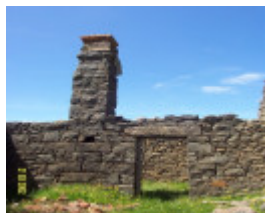
23288 Albert Homestead complex house 1860