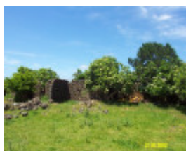
23288 Albert Homestead complex woolshed 1868