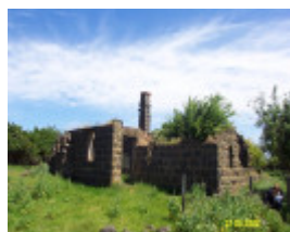
23288 Albert Homestead complex house 1862