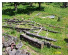
23288 Albert Homestead complex first house 1866