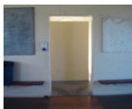
poplar oval pavilion interior exit jun07 jmb