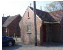
royal park toilet block pavilion apr07 jmb