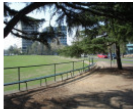
poplar oval pavilion spectator seats apr07 jmb