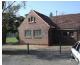
poplar oval toilets apr07 jmb