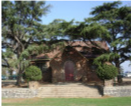
royal park pavilion steps entrance apr07 jmb