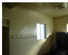
poplar oval pavilion interior with coat hooks jun07 jmb