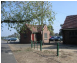
royal park toilet block apr07 jmb