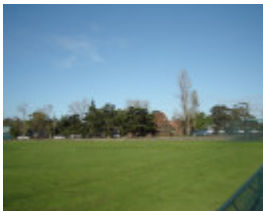
poplar park pavilion view from oval jun07 jmb