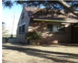
poplar oval pavilion front elevation jun07 jmb