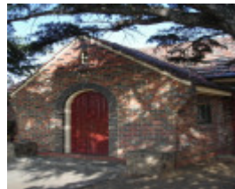
royal park pavilion front entrance apr07 jmb