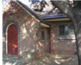
royal park pavilion front entrance detail apr07 jmb