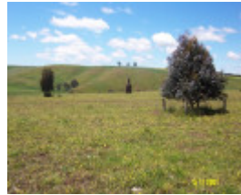
23400 Riverside original site 0173