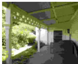
23400 Riverside Side verandah 0182