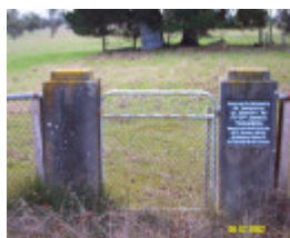
23417 Memorial Gates Mooralla 1179