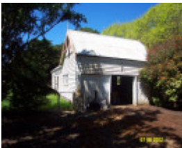
23426 Woodhouse stables 1740