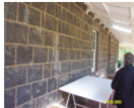
23426 Woodhouse facade 1725