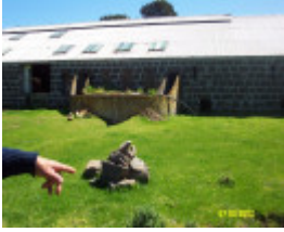
23426 Woodhouse woolshed 1950s dip 1752