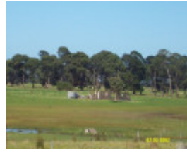
23426 Woodhouse mens quarters 1748