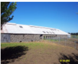
23426 Woodhouse woolshed 1746