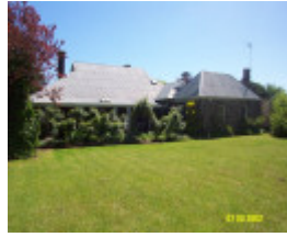
23426 Woodhouse rear 1736