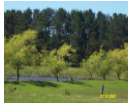
23426 Woodhouse dam lake 1749