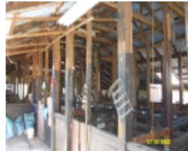
23426 Woodhouse woolshed 1744