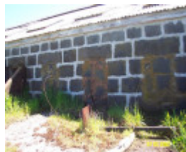
23426 Woodhouse woolshed 1754