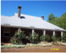
23426 Woodhouse facade 1728