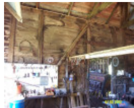
23426 Woodhouse stables slab wall 1741