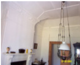
23426 Woodhouse dining room ceiling 1721