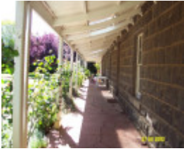
23426 Woodhouse front verandah 1732