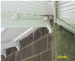
23426 Woodhouse verandah detail 1733