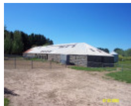
23426 Woodhouse woolshed 1747