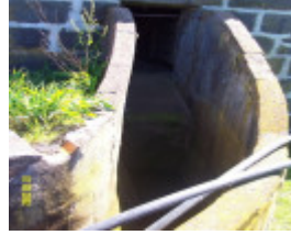
23426 Woodhouse woolshed 1950s dip 1753