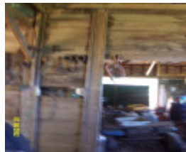
23426 Woodhouse stables slab wall 1742