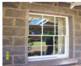
23426 Woodhouse facade window 1726