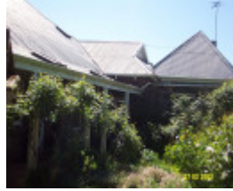
23426 Woodhouse side verandah kitchen 1735