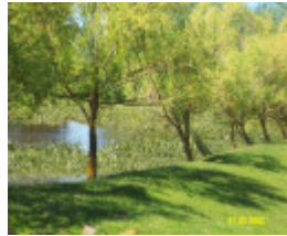
23426 Woodhouse dam lake 1750