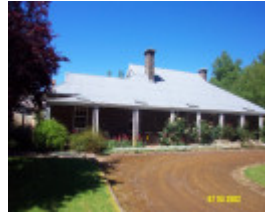
23426 Woodhouse facade 1729