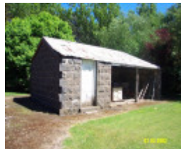
23426 Woodhouse coach house 1737