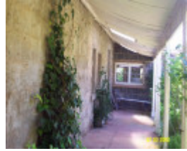
23426 Woodhouse side verandah 1734