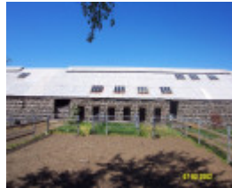
23426 Woodhouse woolshed 1745