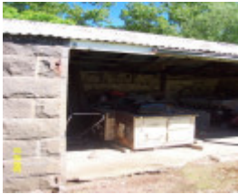
23426 Woodhouse coach house hinges 1739