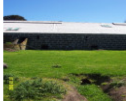
23426 Woodhouse woolshed drain 1751