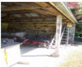
23426 Woodhouse coach house 1738