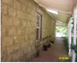
23426 Woodhouse side verandah 1731