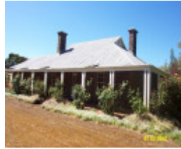
23426 Woodhouse facade 1730