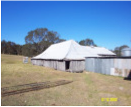
23434 Glendinning Homestead Balmoral woolshed 2149