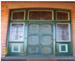
23434 Glendinning Homestead Balmoral front door 2134