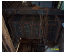
23434 Glendinning Homestead Balmoral woolpress 2136