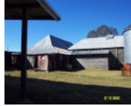
23434 Glendinning Homestead Balmoral woolshed 2148