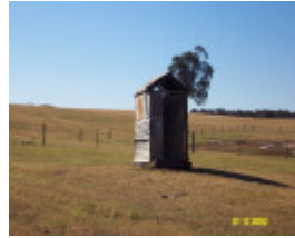
23434 Glendinning Homestead Balmoral woolshed dunny 2145