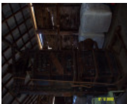
23434 Glendinning Homestead Balmoral woolpress 2137