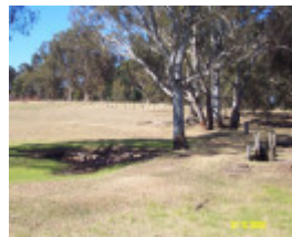
23434 Glendinning Homestead Balmoral sheep dip 2144