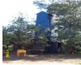
23434 Glendinning Homestead Balmoral carbide tower 2135