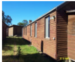
23434 Glendinning Homestead Balmoral men s quarters 2151