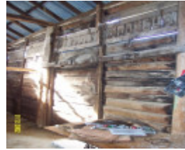
23434 Glendinning Homestead Balmoral woolshed slabs 2139