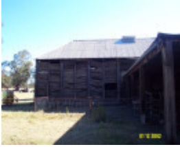
23434 Glendinning Homestead Balmoral woolshed 2146