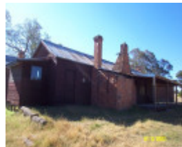
23434 Glendinning Homestead Balmoral men s quarters 2150