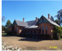
23434 Glendinning Homestead Balmoral facade 2133