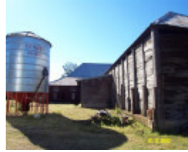
23434 Glendinning Homestead Balmoral woolshed 2147