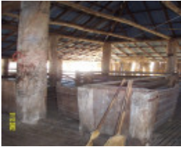
23434 Glendinning Homestead Balmoral woolshed 2141