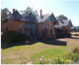
23434 Glendinning Homestead Balmoral facade 2132