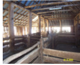
23434 Glendinning Homestead Balmoral woolshed 2143