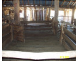
23434 Glendinning Homestead Balmoral woolshed 2142