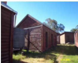
23434 Glendinning Homestead Balmoral men s quarters 2152