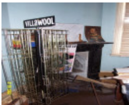
23437 Courthouse Former Martin St Penshurst interior 1033