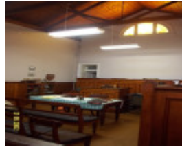
23437 Courthouse Former Martin St Penshurst interior 1027