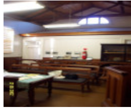
23437 Courthouse Former Martin St Penshurst interior 1028