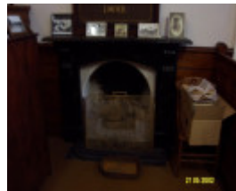
23437 Courthouse Former Martin St Penshurst interior 1030