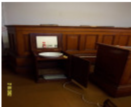
23437 Courthouse Former Martin St Penshurst interior 1031