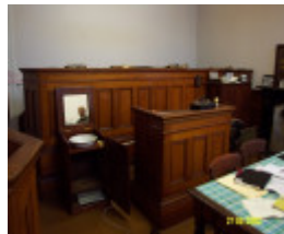
23437 Courthouse Former Martin St Penshurst interior 1032