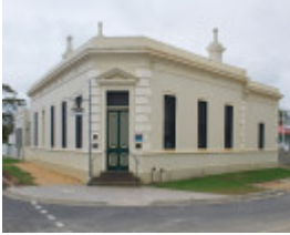
PORT ALBERT MARITIME MUSEUM SOHE 2008