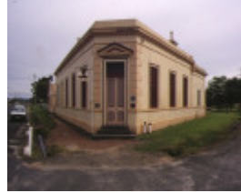
1 bank of victoria bay street port albert front view