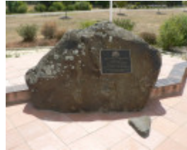
Detail of war memorial, Haddon Memorial Reserve