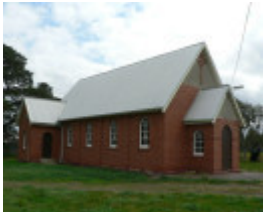
St Mary's Catholic Church, Midland Highway, Lethbridge