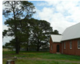
St Mary's Catholic Church, Midland Highway, Lethbridge