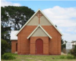
November 2003.