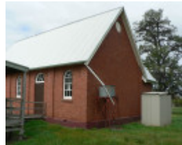
St Mary's Catholic Church, Midland Highway, Lethbridge