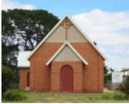
November 2003.