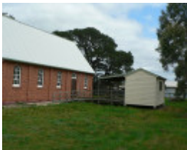
St Mary's Catholic Church, Midland Highway, Lethbridge