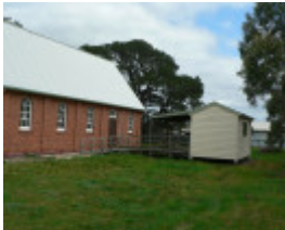
St Mary's Catholic Church, Midland Highway, Lethbridge