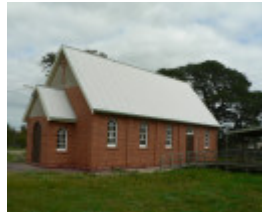
St Mary's Catholic Church, Midland Highway, Lethbridge