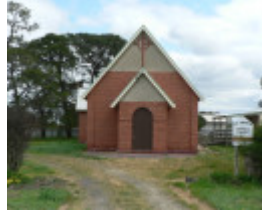
St Mary's Catholic Church, Midland Highway, Lethbridge