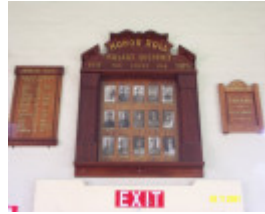
23634 Cavendish Memorial Hall 0137