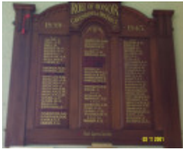
23634 Cavendish Memorial Hall 0139