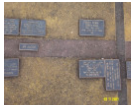
23634 Cavendish Memorial Park 0129