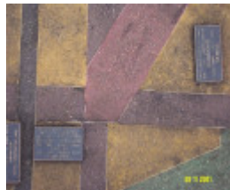
23634 Cavendish Memorial Park 0130