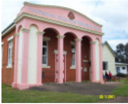
23634 Cavendish Memorial Hall 0132