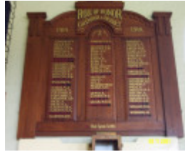
23634 Cavendish Memorial Hall 0138