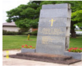
23634 Cavendish Memorial Park 0126