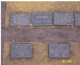
23634 Cavendish Memorial Park 0128