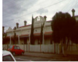
1 jubilee terrace nott st port melbourne