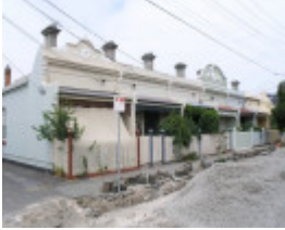
JUBILEE TERRACE SOHE 2008