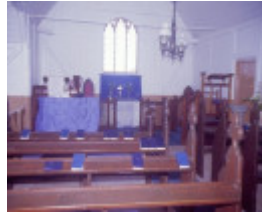
tarraville church tyers street tarraville front interior she project 2004