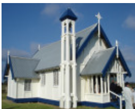
Front of church on 150th anniversary