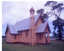
tarraville church tyers street tarraville left front she project 2004