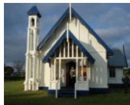
Front of church on 150th anniversary