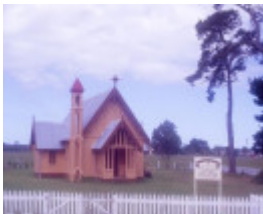
tarraville church tyers street tarraville front view she project 2004