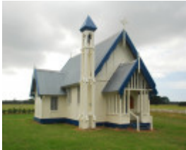
CHRIST CHURCH SOHE 2008