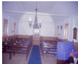
tarraville church tyers street tarraville rear of interior she project 2004