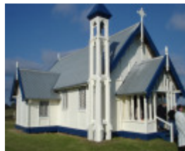
Front of church 150th anniversary