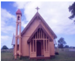
1 tarraville church tyers street tarraville close up she project 2004