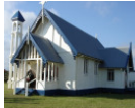
Exterior June 2006