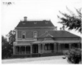
Golf Hill, taken Feb. 20, 1966.