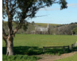
23706 Entrance to Golf Hill with the Presbyterian Church Shelford 223