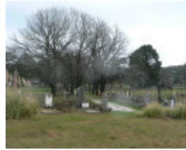
Smythesdale General Cemetery, Glenelg Highway Scarsdale