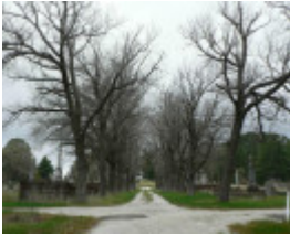
Smythesdale General Cemetery, Glenelg Highway Scarsdale