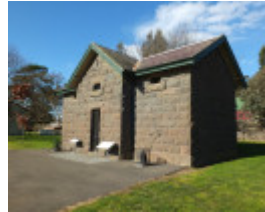
Smythesdale Lock Up