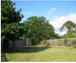
November 2003.