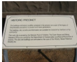
November 2003.