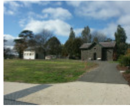
Former Police Lock Up & Stables