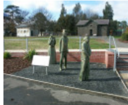
Former Police Lock Up & Stables