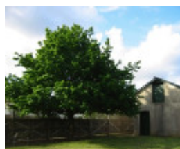
November 2003.