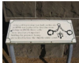
November 2003.