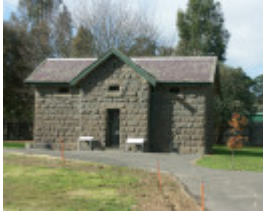
Former Police Lock Up