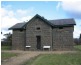
23730 Lock up and Police Station Smythesdale