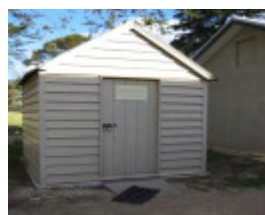
November 2003.