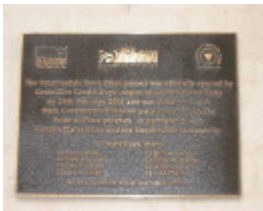
November 2003.