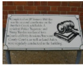
November 2003.