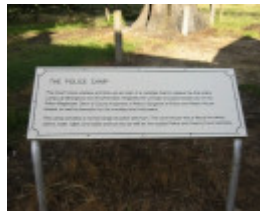
November 2003.