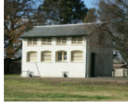
Former Police Stables