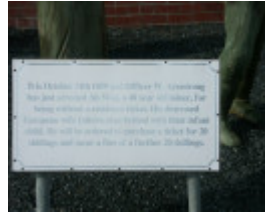
Former Police Lock Up & Stables