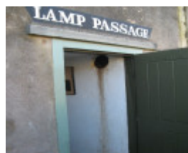
Portland Battery_28 Apr 2011_KJ (47).jpg