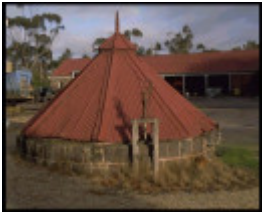
National Estate Register, 2003.