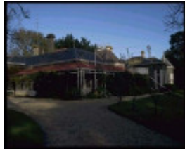
National Estate Register, 2003.