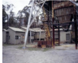
h01879 1 wattle gully gold mine fryerstown road chewton poppet head she project 2003