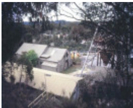
h01879 wattle gully gold mine fryerstown road chewton engine house she project 2003