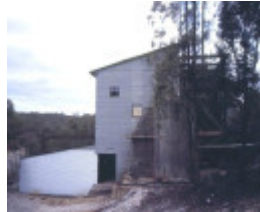
h01879 wattle gully gold mine fryerstown road chewton battery house she project 2003