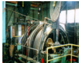
h01879 wattle gully gold mine winding gear 96 db