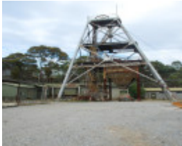
WATTLE GULLY GOLD MINE SOHE 2008