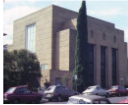
1 second church of christ scientist camberwell front view