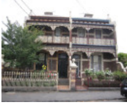
18-20 Davies Street.JPG