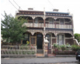
18-20 Davies Street.JPG