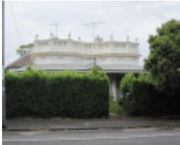
43 Kent Street.JPG