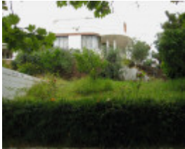
95 Mooltan Street.JPG