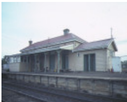
1 kaniva railway station moore street kaniva platform view jul1984