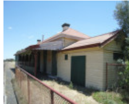
KANIVA RAILWAY STATION SOHE 2008