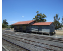
KANIVA RAILWAY STATION SOHE 2008