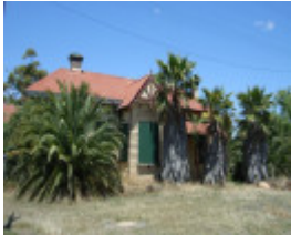
KANIVA RAILWAY STATION SOHE 2008