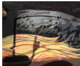
Shoeing forge 258 Racecourse Road