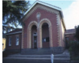
ararat court house front view jun1984