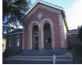
ararat court house front view jun1984