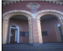
ararat court house entrance detail jun1984