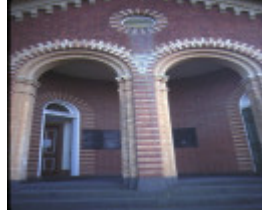
ararat court house entrance detail jun1984