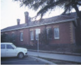
ararat court house side view jun1984