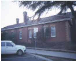
ararat court house side view jun1984