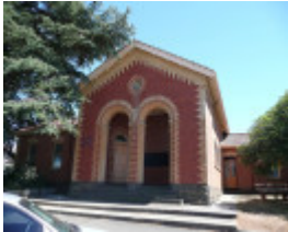
ARARAT COURT HOUSE SOHE 2008