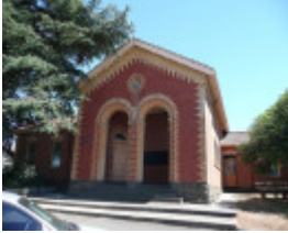
ARARAT COURT HOUSE SOHE 2008