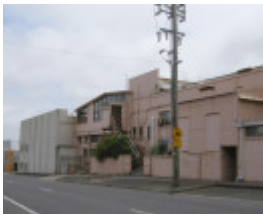
FLETCHER JONES FACTORY AND GARDENS SOHE 2008