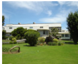
H2101 fletcher jones warrnambool 18nov05 ac garden canteen