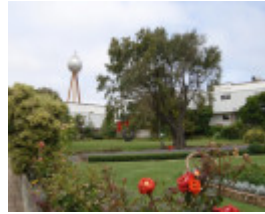
FLETCHER JONES FACTORY AND GARDENS SOHE 2008