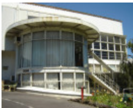
H2101 fletcher jones warrnambool 18nov05 ac round room