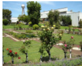
H2101 fletcher jones warrnambool 18nov05 ac garden pond2