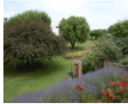
FLETCHER JONES FACTORY AND GARDENS SOHE 2008