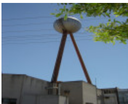
H2101 fletcher jones warrnambool 18nov05 ac water tower