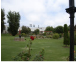
FLETCHER JONES FACTORY AND GARDENS SOHE 2008