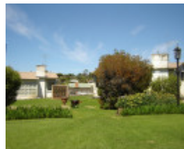
H2101 fletcher jones warrnambool 18nov05 ac RVIA 1