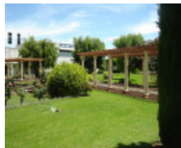
H2101 fletcher jones warrnambool 18nov05 ac pergola walk4