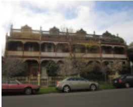
2-8 Bayview Terrace.JPG