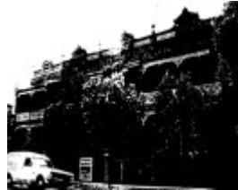
Essendon Conservation Study 1985