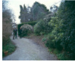
H01962 HO1962 marshall garden front 2001