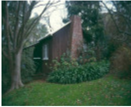
H01962 HO1962 marshall garden studio 2001