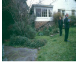
H01962 HO1962 marshall garden paving 2001