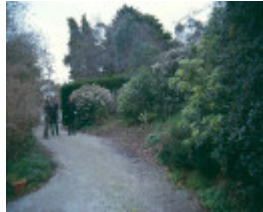
H01962 HO1962 marshall garden front 2001