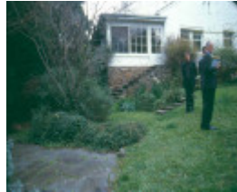
H01962 HO1962 marshall garden paving 2001